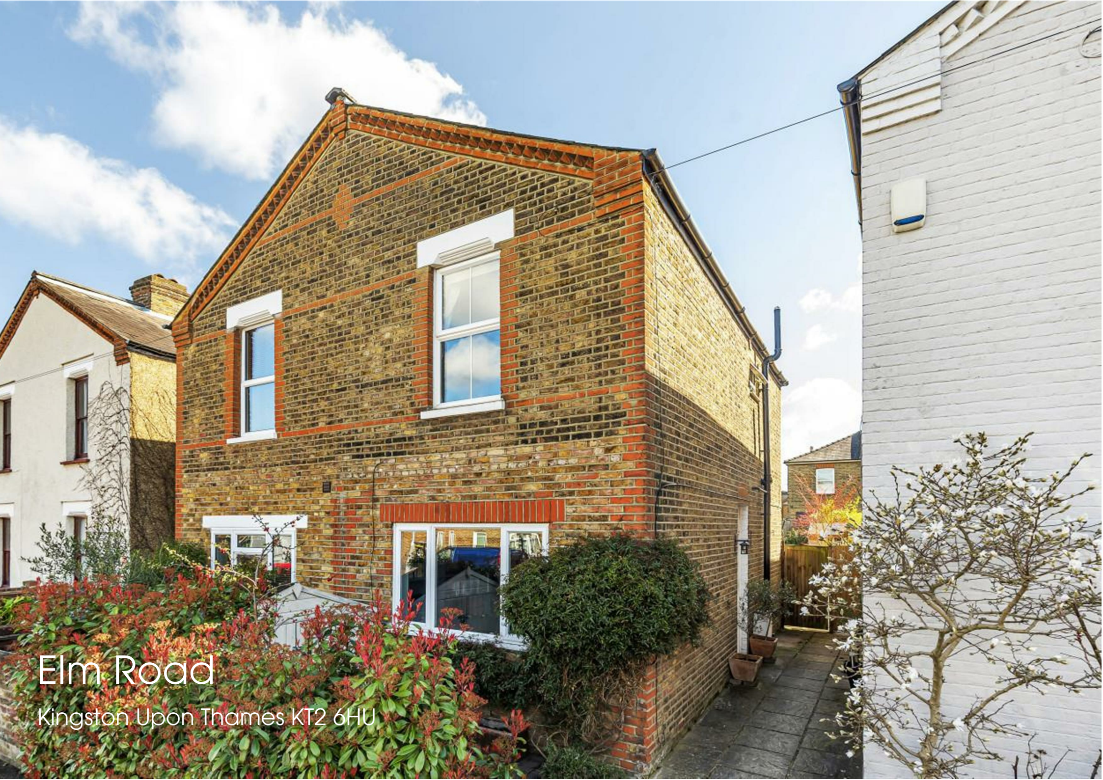
Elm Road Kingston upon Thames KT2 6HU